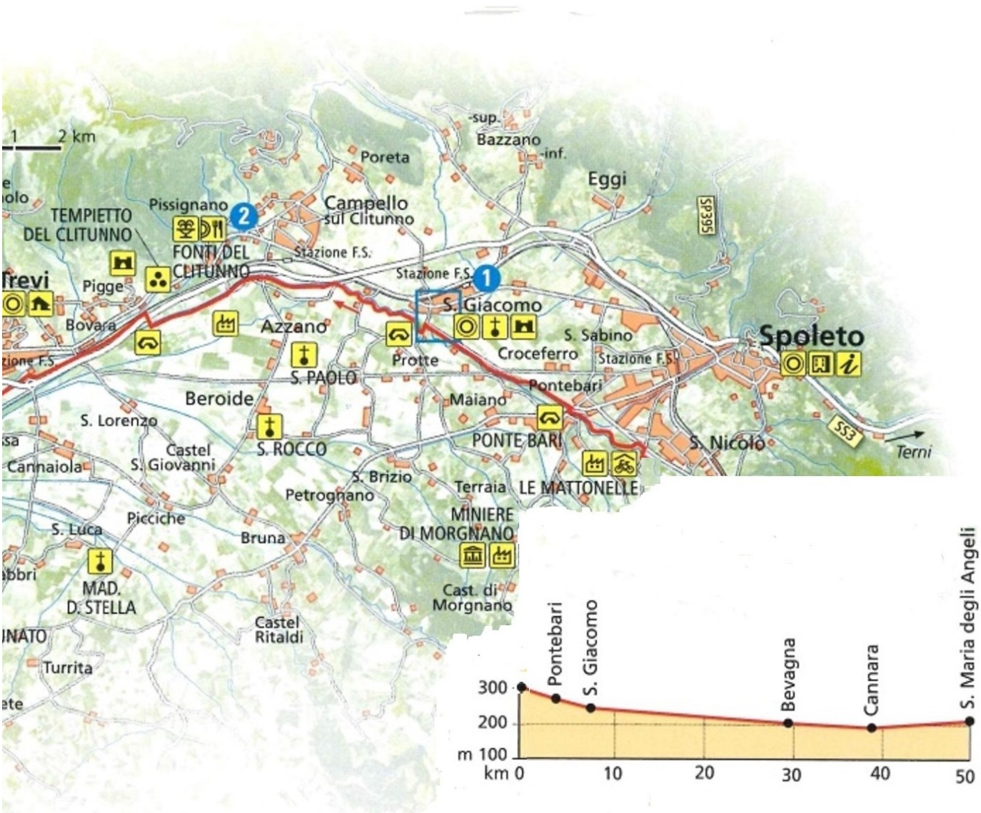
Mappa TCI "Giro in Italia" Centro-Sud 2010